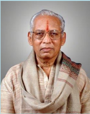
Dr Vempati Chinna Satyam

Dr. Vempati Chinna Satyam dedicated his life to preserve, promote and propagate Kuchipudi in India and all over the world. A charismatic performer, a brilliant choreographer and an inspiring teacher, he has been largely responsible for the revival of Kuchipudi dance in post-independent India. Hence, the name Vempati Chinna Satyam has become synonymous with Kuchipudi, as one who put Kuchipudi dance on the world map.