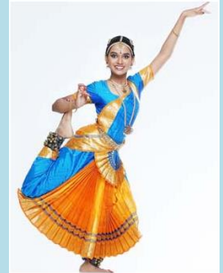
Kuchipudi dance pose